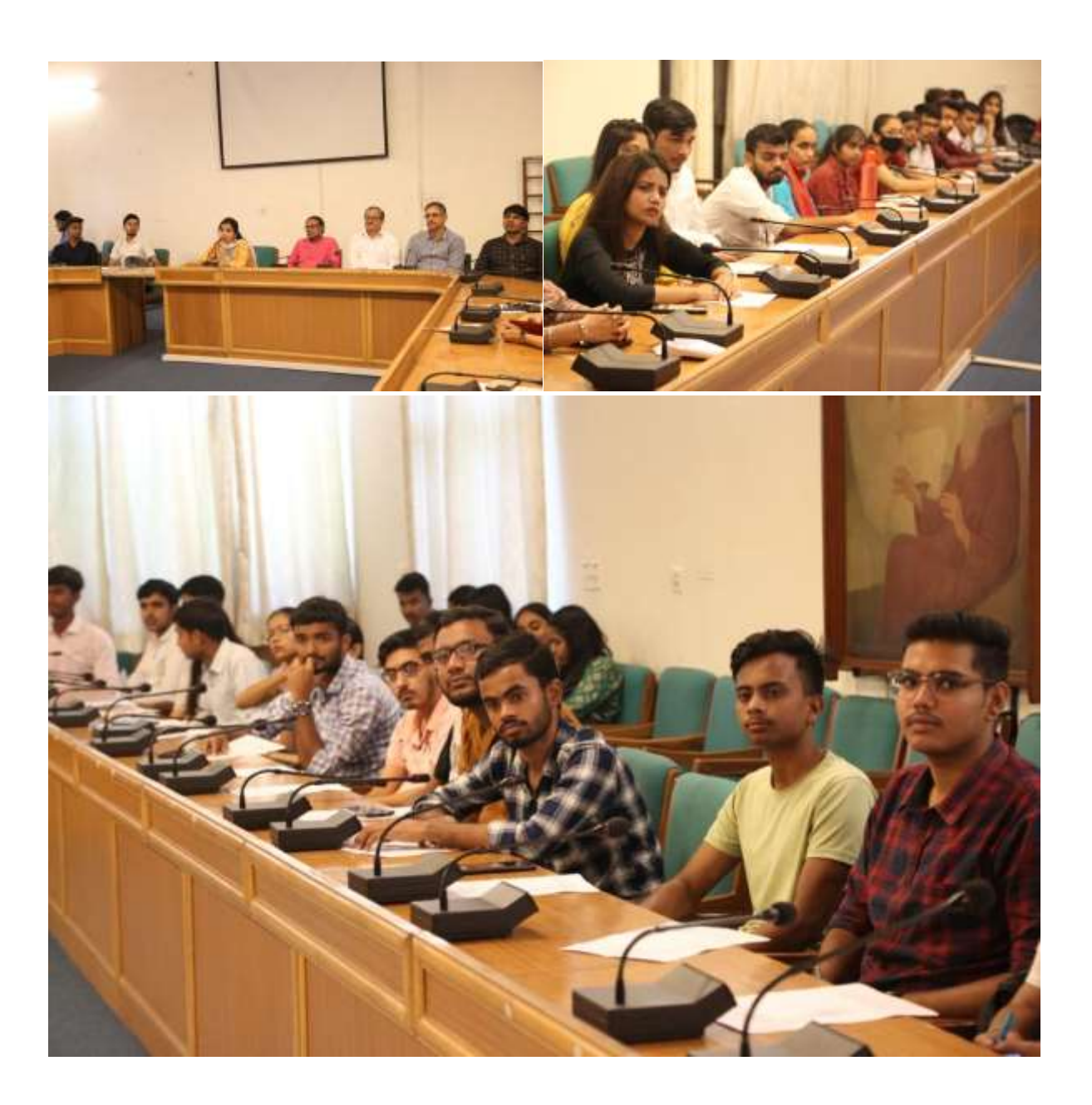
10.Poster making competition 2023- Gandhi study circle has organized poster making competition on 30<sup>th</sup> January 2023 on the occasion of Martyrs Day. The theme of the competition was Martyrs day and peace. 11 students have participated and 3 students were given prizes.